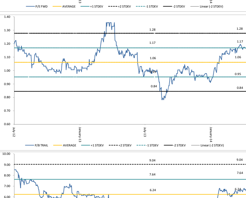
Figure 5. P/E Trailing BJTM